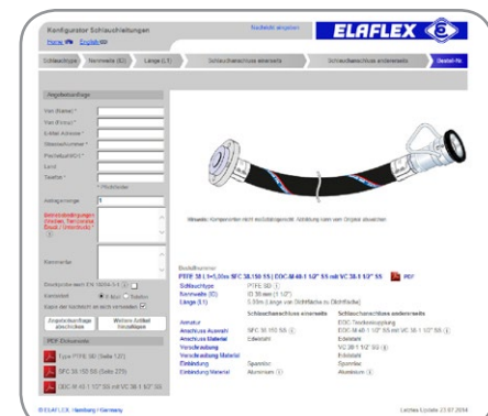
Result with correct order number and technical hints

German Industry Award 'Initiative Mittelstand 2014'