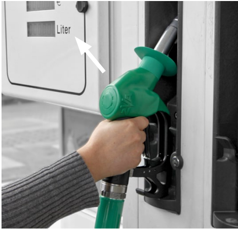
Take nozzle from dispenser