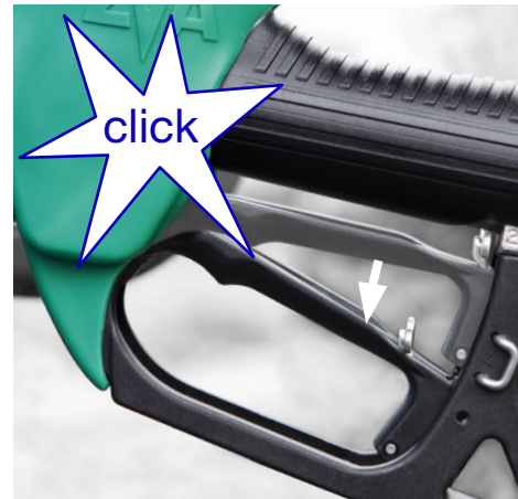
Automatic shut-off, either by preset or when tank is full. Wait for some seconds before removing nozzle.