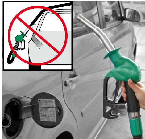
Tank opening should be near dispenser. Take nozzle towards the car, spout pointing upward.