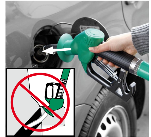
Insert nozzle in tank opening. Ensure nozzle is properly engaged and cannot fall out.