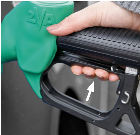
When dispenser is ready, lift the lever to dispense fuel