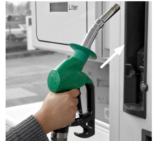
With spout pointing upward, put back nozzle to dispenser