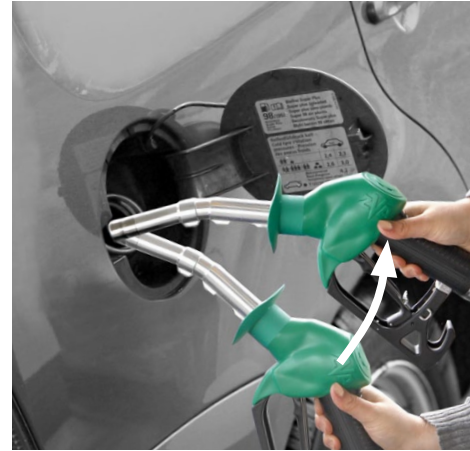
When spout tip is near tank opening, tilt the nozzle