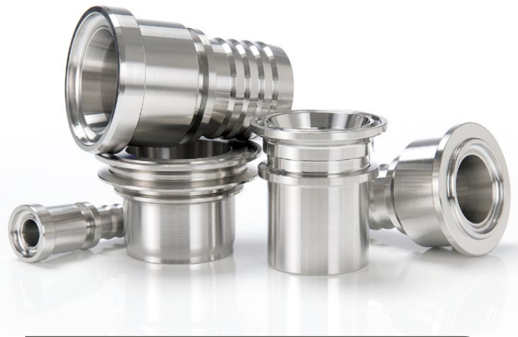
Crimping 'free of dead spaces / flared'

Crimped hose coupling with flush-mounted hose tail. No obstruction of inner cross-section, almost no gap or dead volume between lining and hose tail. For high purity requirements. Suitable for all coupling types.