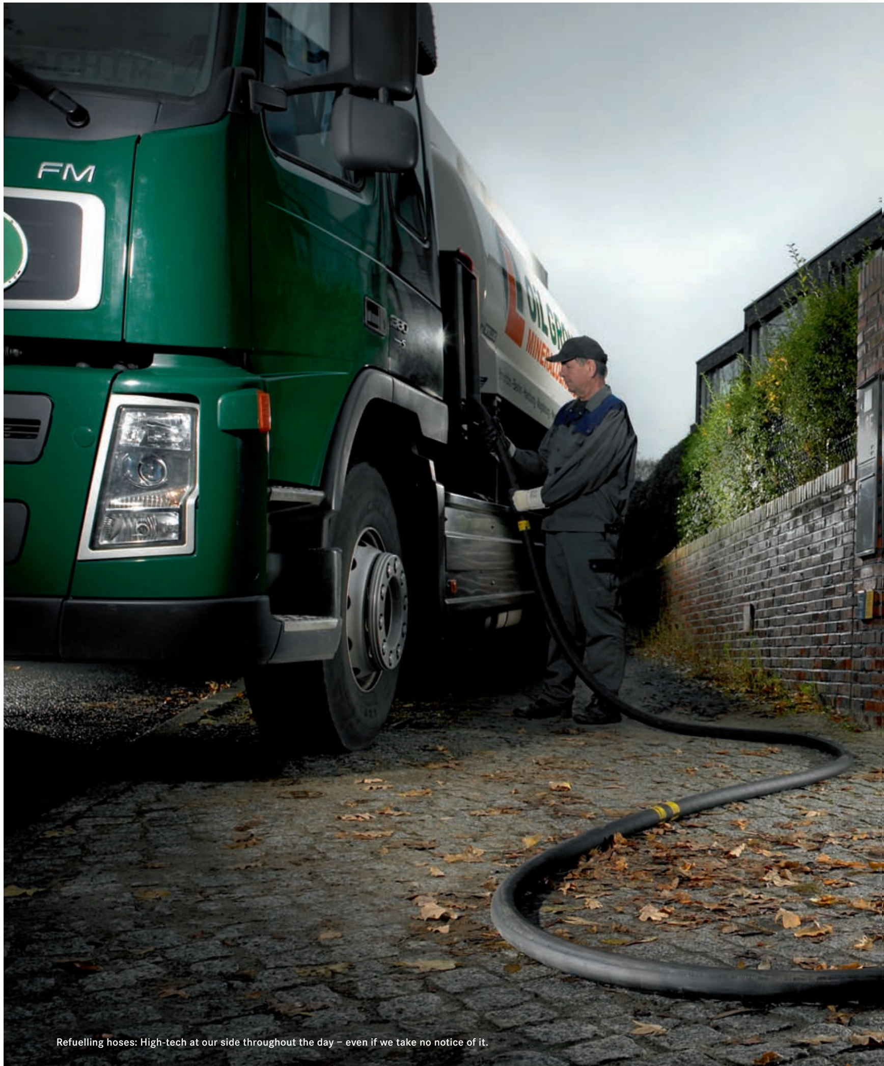
Refuelling hoses: High-tech at our side throughout the day – even if we take no notice of it.