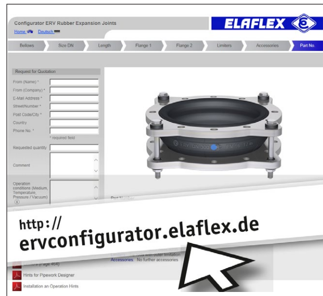
ERV-BR configuration, one of many size/flange/accessories combinations