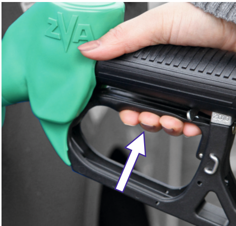
When dispenser is ready, lift the lever to dispense fuel.