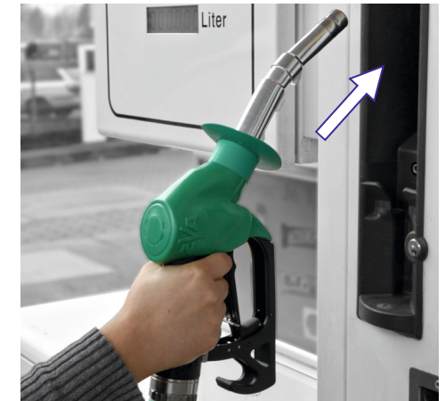
With spout pointing upward, put back nozzle to dispenser.