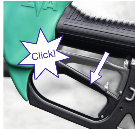
Automatic shut-off, either by preset or when tank is full. Wait for some seconds before removing nozzle.