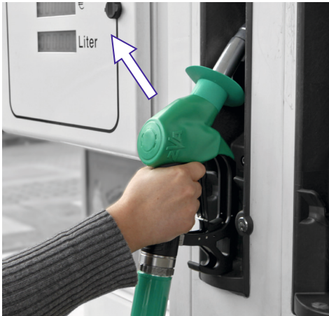
Take nozzle from dispenser.