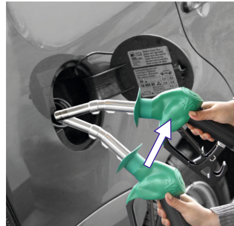
When spout tip is near tank opening, tilt the nozzle.