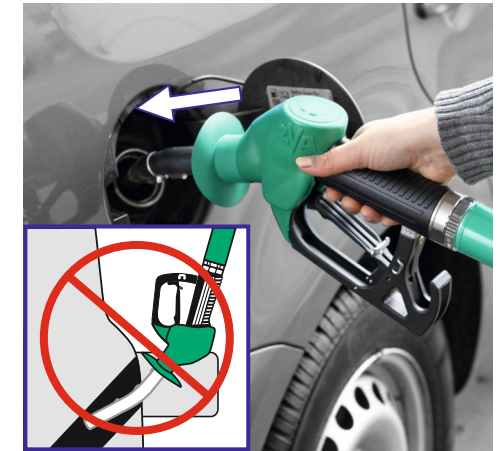
Insert nozzle in tank opening. Ensure nozzle is properly engaged and cannot fall out.