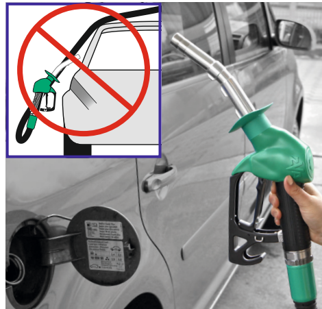
Tank opening should be near dispenser. Take nozzle towards the car, spout pointing upward.