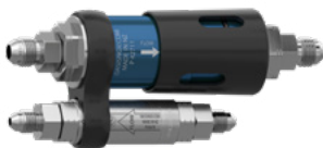
SB-CNG (Safety Break)