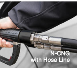
N-CNG with Hose Line