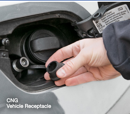
CNG Vehicle Receptacle

You can now enjoy all the usual ELAFLEX benefits – fast delivery from our warehouse, customer-friendly operation and uncompromising safety – for your existing and new CNG refuelling customers. You also benefit from practice-orientated handling, repair- and maintenance-friendly design and a convincing price-performance ratio.